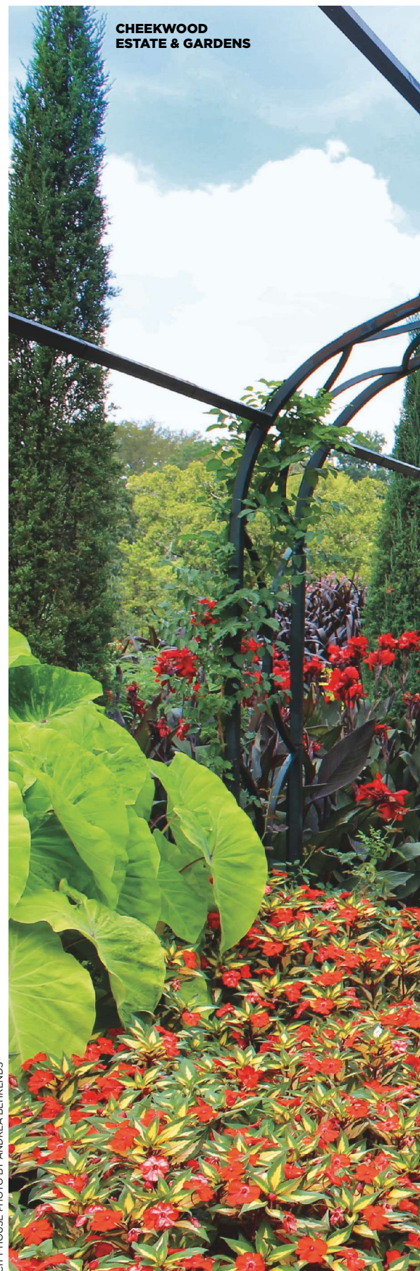
CITY HOUSE