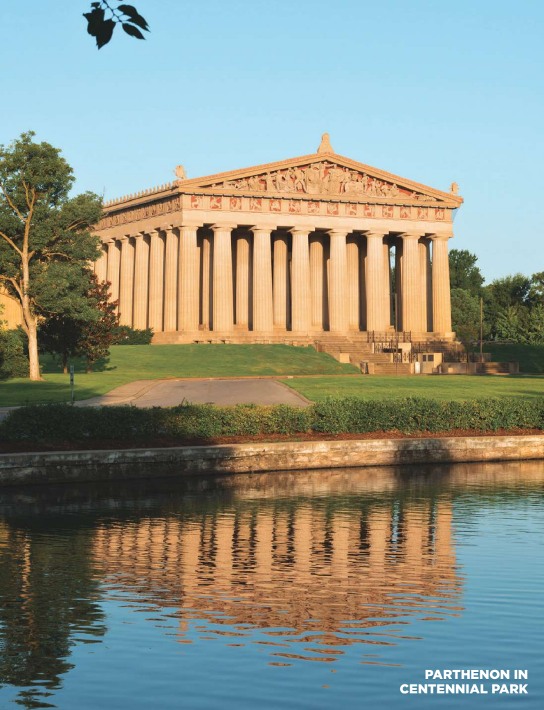
PARTHENON IN CENTENNIAL PARK