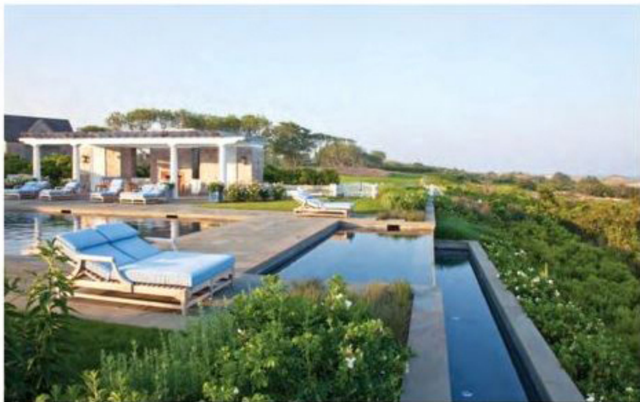
An elevated pool terrace features a series of pools that reflect the summer sky (above). A bluestone walkway lined with hydrangea leads to the pool house and pergola (below).

First is the site's natural ecology, whether in the woods or along the ocean, and factors like sun and wind. Second is the architectural ecology. “We aren't modernists or tradi-